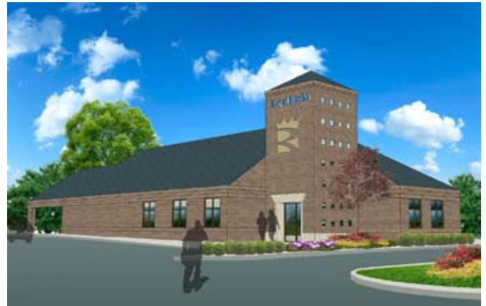
A rendering of Royal Banks of Missouri's new building to be constructed near the bank's current site.