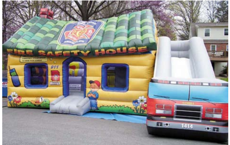
Glendale’s Inflatable Fire Safety House will debut July 21 at Glendale Night Out.

The promotions became effective in early June.